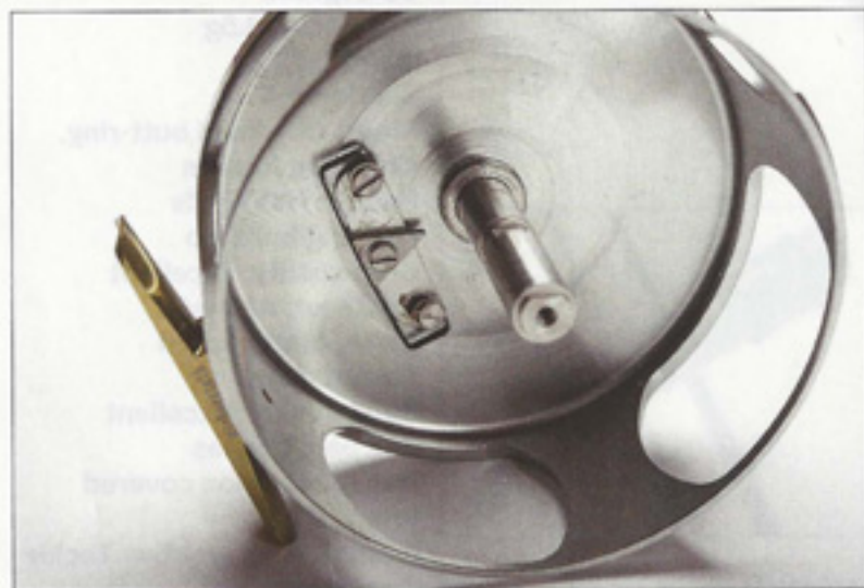
Single spring pawl. Clicks loudly and provides check against the spool spinning.

Price: £385 (supplied in a fitted soft leather case) From: Tweedside Tackle, Kelso Distributed by Bloke Rods, 6 Market Place, Selkirk. Tel: 01750 725770.