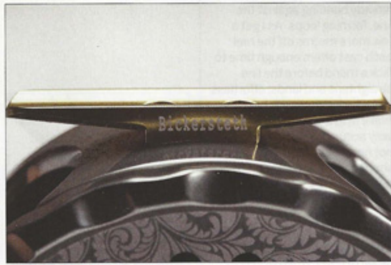
Brass reel foot with inscription. Note the engraved finish and scalloped rim.